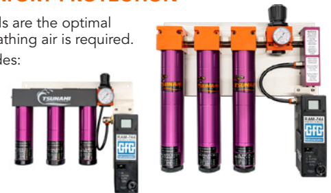
SINGLE-USER PANEL #21999-0980